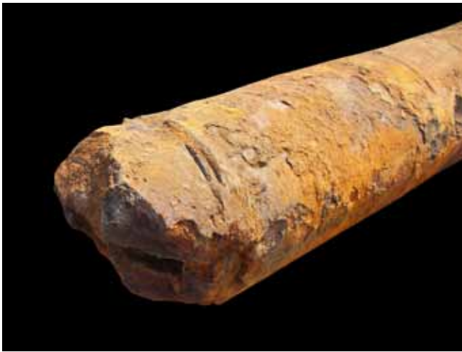
Fig. 6. Detail of the broken bore of the salvaged 8-pounder.