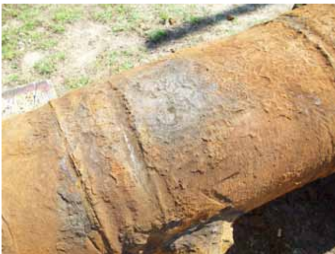
Fig. 8. Detail of a fleur de lys on the second reinforce.

gunner's 'V' near the muzzle). This form of versatile ordnance was mainly situated on stanchions or on rails at the high ends of a vessel and along the main deck. On warships they were mounted on platforms between the lower mast and topmast. In these positions they could be used effectively to rain fire down on a vessel's main deck.