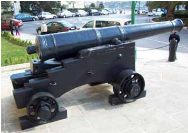
Fig. 9. An 8-pounder French iron cannon at Valletta, Malta, of the salvaged Marquise de Tourny form.

Trawling can be a hazardous job in the European coastal seas. Many fishermen have lost their lives after striking exploding sea mines, torpedos and bombs, which surfaced in their nets. Sometimes the heavy weight snagged in a net is a harmless cannon. These are always landed, unlike some other categories of finds that are usually dumped on wreck sites. A gun in the net can deliver some easy cash for the crew and good money if it is a bronze gun. To avoid paying taxes (import tax, income tax) on this extra item of income, the find is typically kept as secret as possible, also because fishermen are afraid their find will be confiscated by heritage authorities. This reality is all very frustrating for the ordnance historian. Sometimes serious detective work is needed to trace a gun once it has entered the black market. Fortunately, there are exceptions when guns are sometimes reported after the trawler lands its catch.