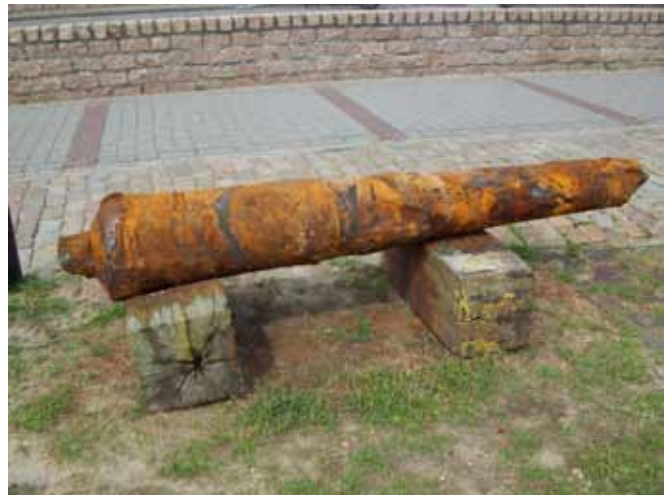
Fig. 3. Full-length view of La Marquise de Tourny's salvaged 8-pounder.

Conservation identified a recovered cannon as a half-pounder swivel gun (L. 85.5cm, bore Diam. 4.0cm). As with the salvaged cannon in question, the swivel gun's first and second reinforces featured a single incised fleur de lys , which were the only markings present (other than a