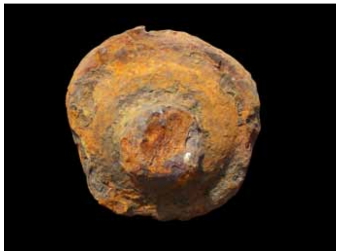
Fig. 5. Detail of the cascable and button of the salvaged 8-pounder.