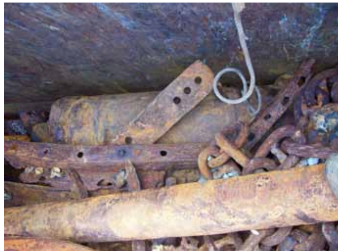
Fig. 1. The iron cannon discarded in a salvage yard dump.

When France started to develop a navy in the first half of the 17th century, few local foundries were capable of casting a strong iron cannon. The iron district of Perigord produced guns and even exported them, but many failed test firings (Klein, 1965: 218). By then the Dutch had already successfully established iron foundries in Sweden, and guns from there soon found their way onto the Amsterdam arms market and onwards to France. By 1674 the first regulations regarding standards for cannon