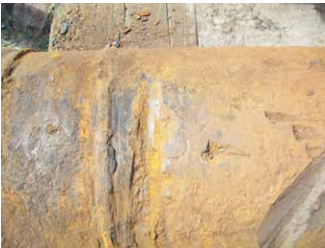
Fig. 7. Detail of a fleur de lys on the first reinforce.