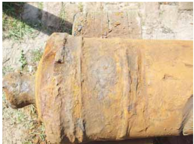
Fig. 4. Detail of the cascable and button of the salvaged 8-pounder.